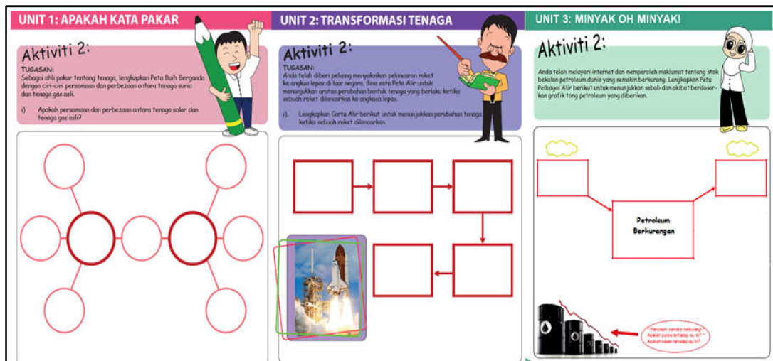
Figure 4. Example of activity sheet 2 of the module