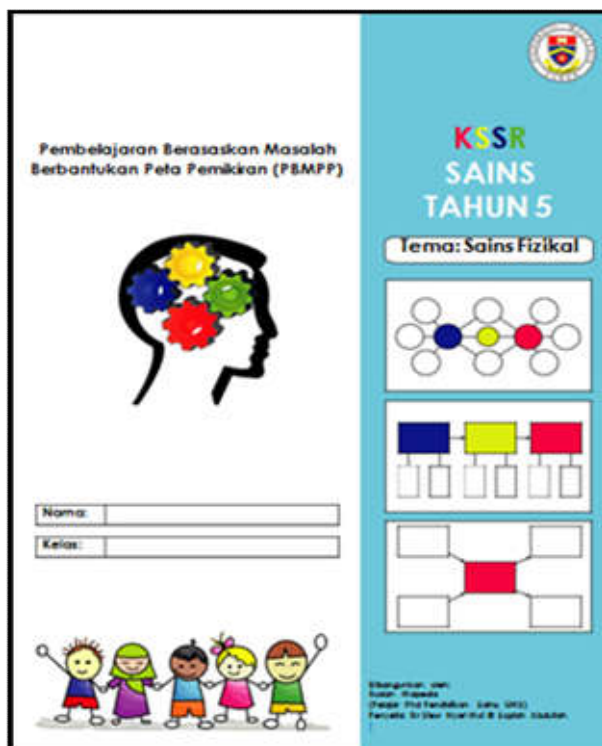
Figure 2. Front page of the module